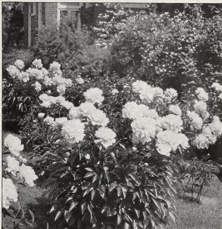
Albert Crousse Peonies